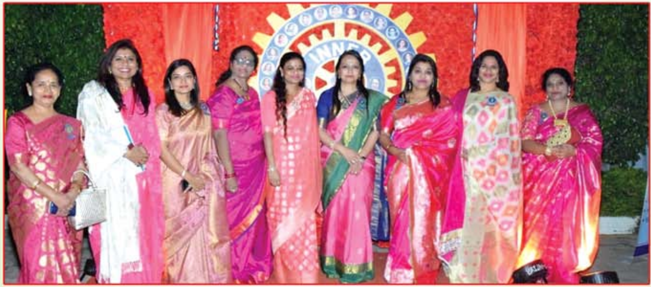
District Executive Committee 2019-20 with Association President