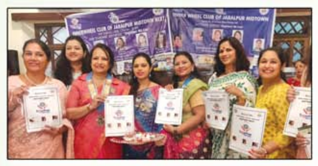
Jabalpur Midtown Next