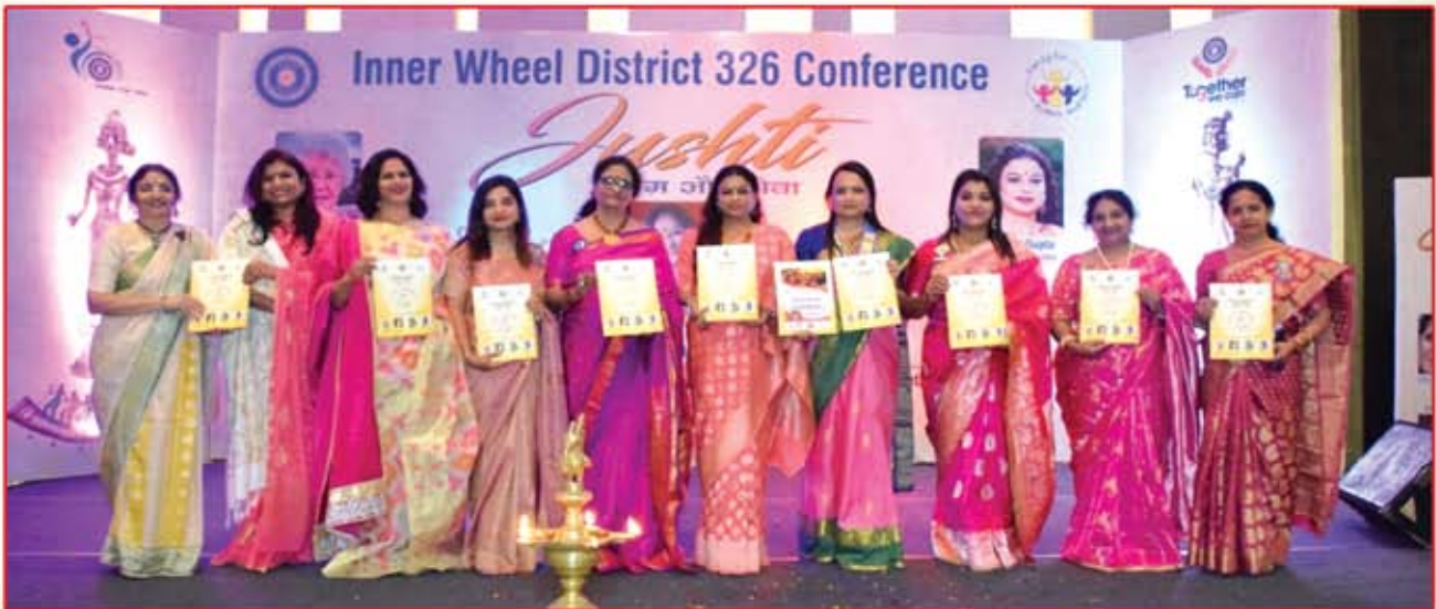
Release of District Souvenir