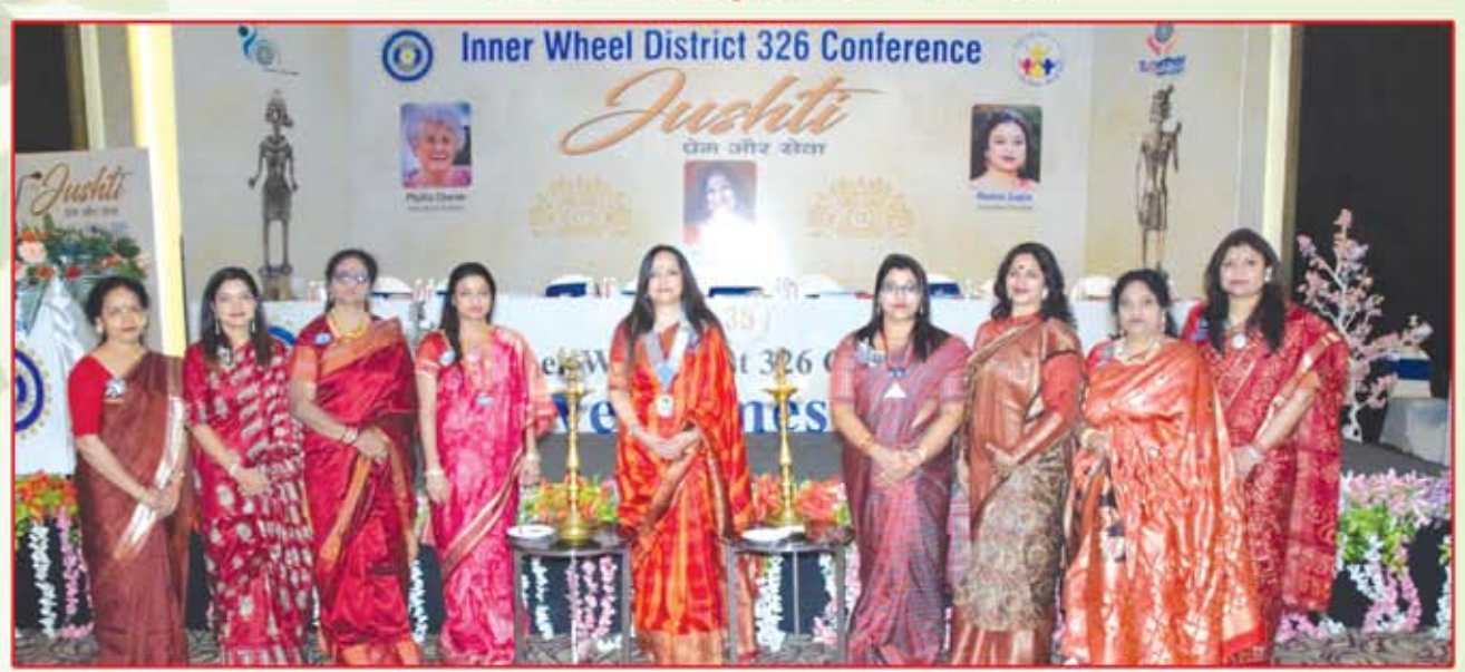
Lighting the Lamp