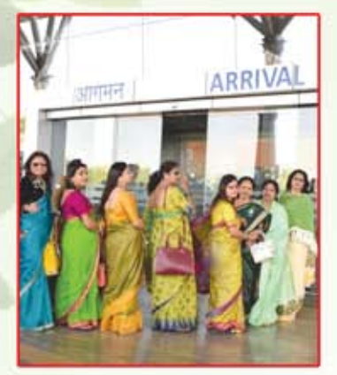
Ready to receive the Association President