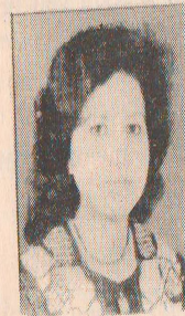
Mrs. Priya Ambrose Public School Surya Mahal Jeypore - 764001 Tel : (06854) 22287, 22733