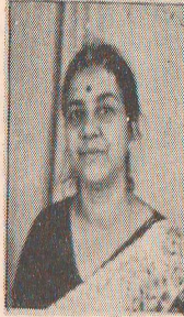
Mrs. Manju Mukherjee Indo English School Campus Birsah Dahar Road, Rourkela. Tel : (0661) 503141